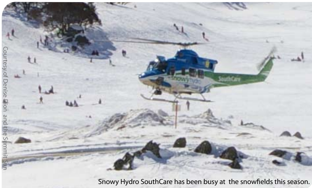
Snowy Hydro SouthCare has been busy at the snowfields this season.

Over the last month, the Service has completed 35 missions including seven missions transporting patients who injured themselves while at the snowfields.